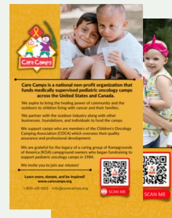
Table Top Banner Options 1 & 2