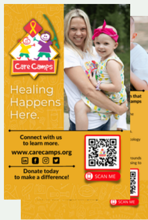
Double Sided Flyer

Contact: 1-800-431-0513 info@carecamps.org www.carecamps.org