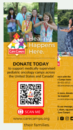
Double Sided Rack Card