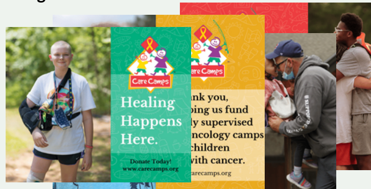
Social Media Posts