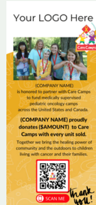
Customizable Standing Banner